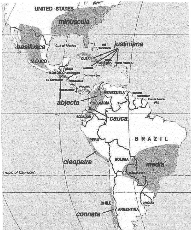
Figure 3. Ranges of some blue-faced species of the Erythrodiplax connata group.

Mexico, at a rain pond at km 49 (4 km S Tehuacán exit) on Oaxaca-Mexico Autopista, 1460 meters, where I took two male fuscus and one male basifusca on 23 September 1999 and saw additional males of each species. At this locality, not only was the difference in frons color obvious, but the two basifusca seen were slightly larger than the half-dozen fuscus seen, with distinctly less dark coloration in the wing base. The three specimens show no sign of intergradation. Additional collecting may bring to light other instances of sympatry of these two species.